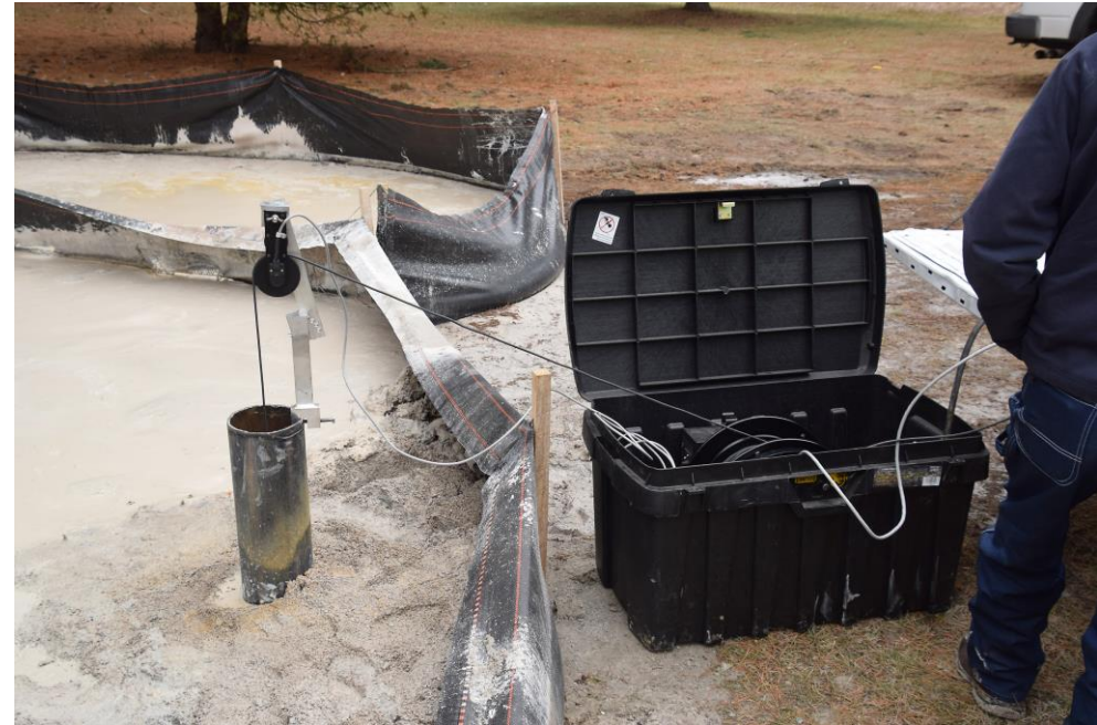
Use camera to quality check well and measure depth; confirm geology