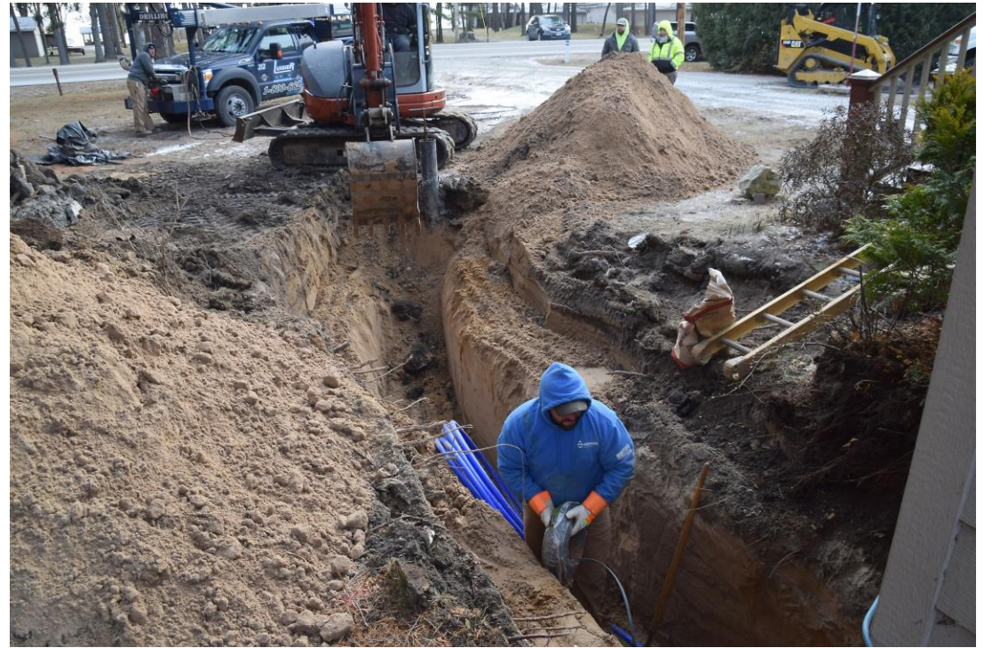
Digging trench and installing pipe to connect well to house