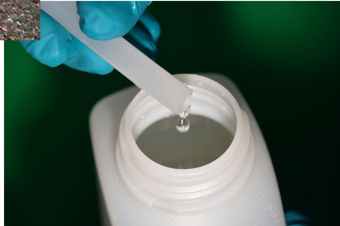
Sample well water before connect to house plumbing