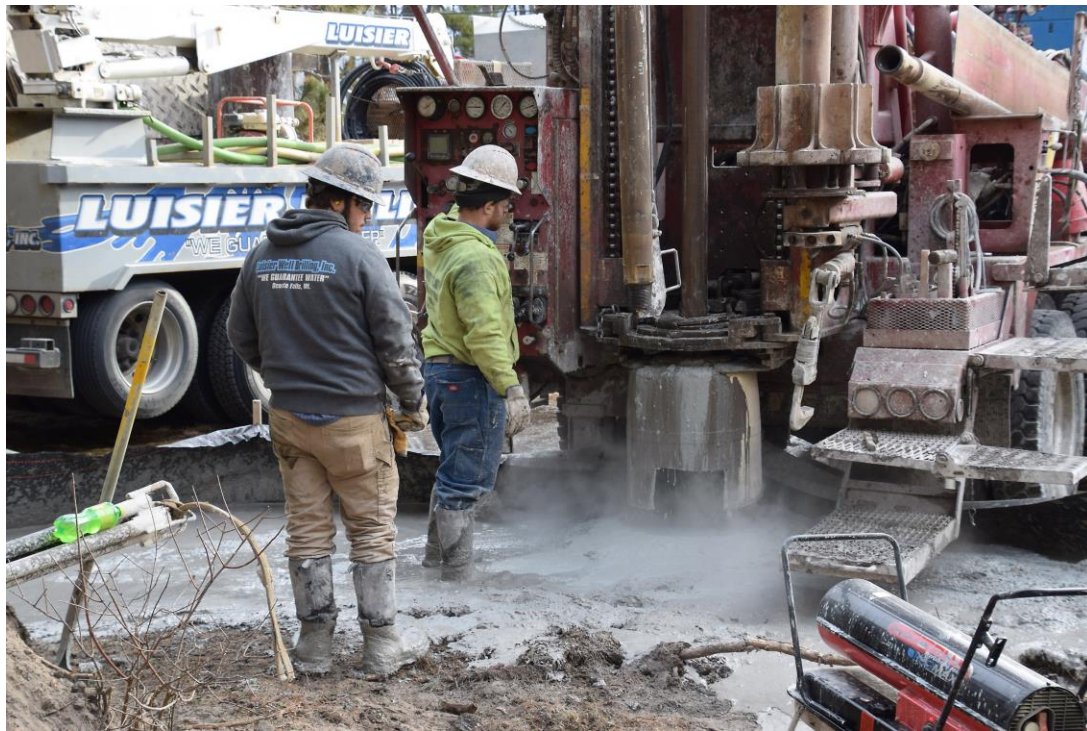
Air-rotary drilling to progress well into bedrock to access deep aquifer (about 500 ft)