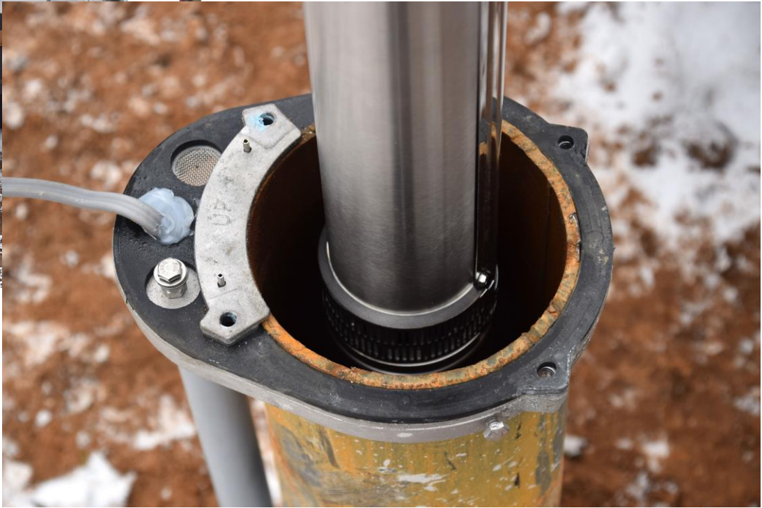
Installing pump in the well