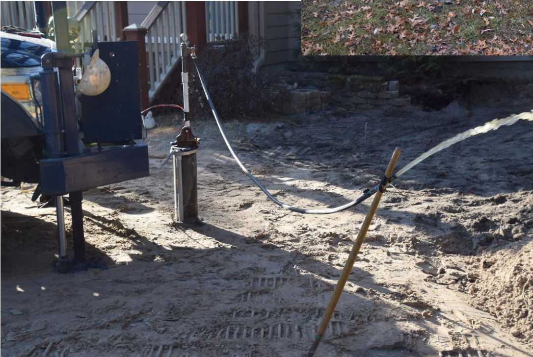
Pumping out deep well to clear water from deep aquifer