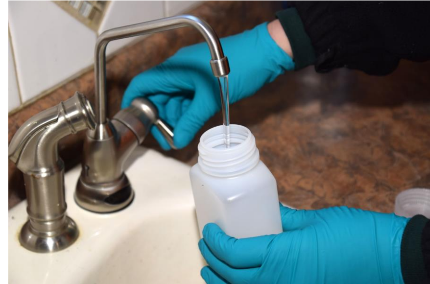
Sample from kitchen sink after water treatment