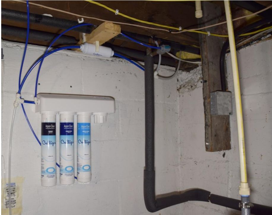
Reverse osmosis system